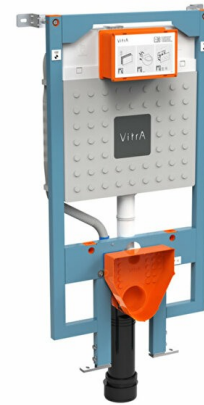
Product code: 768-5800-01