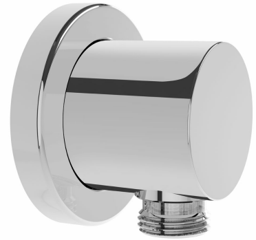
Product Code: A45223